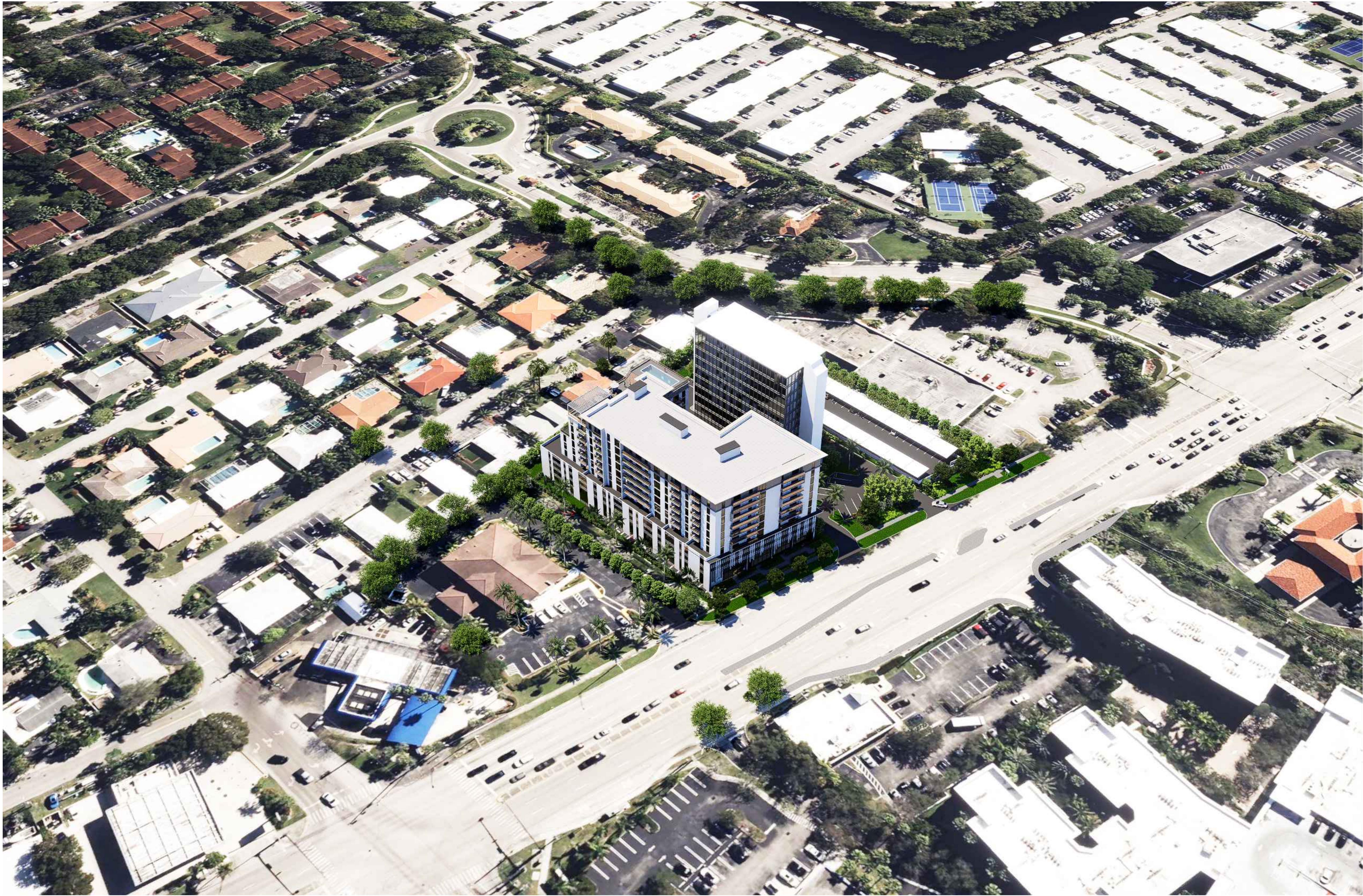
AREA VIEW LOOKING SOUTH EAST